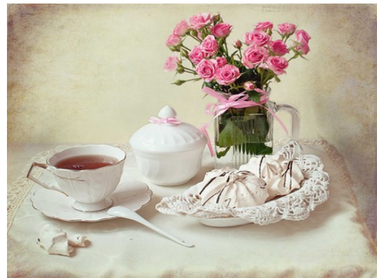
Tea Time June 1st